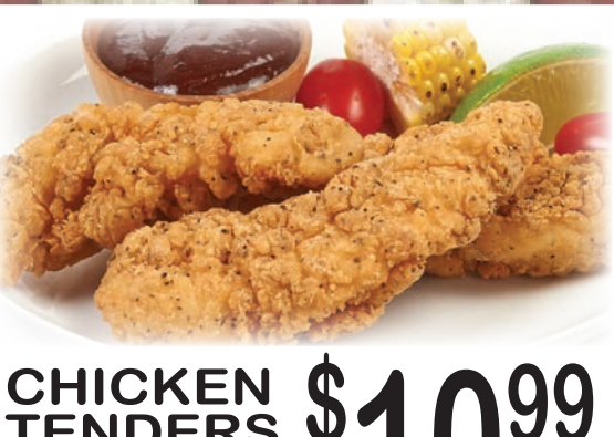
CHICKEN TENDERS 10 Lb. Box Homestyle