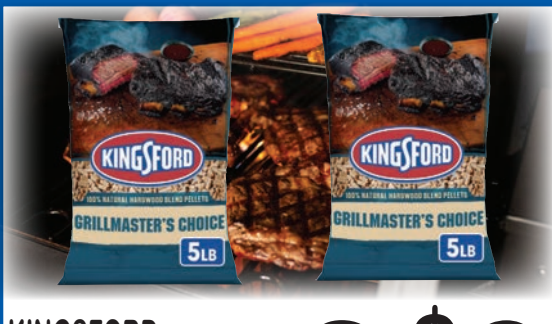
KINGSFORD HARDWOOD PELLETS Grill Master's Choice ONLY