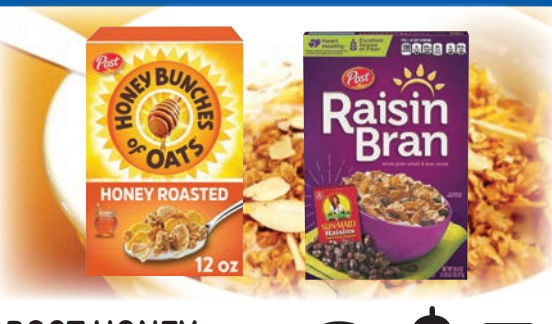
POST HONEY BUNCHES OF OATS 11-12 Oz. Selected Varieties or 16.6 Oz. Raisin Bran