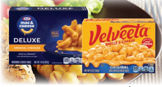
KRAFT DELUXE MAC & CHEESE 14 Oz. Original or 12 Oz. Original Velveeta Shells & Cheese