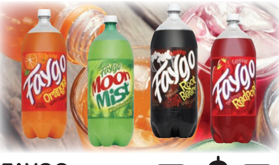
FAYGO SOFT DRINKS 5 Selected Varieties 5 for 5