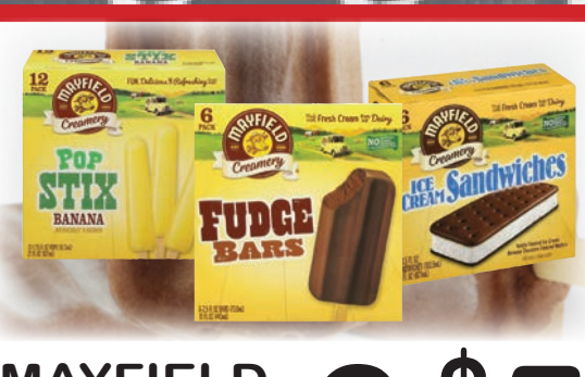
MAYFIELD NOVELTIES 2 $5 6 Pk. Bars or Ice Cream Sandwiches or 12 Pk. Pop Stix Selected Varieties