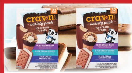
CRAV'N FLAVOR ICE CREAM TREATS 32 Ct. Variety Pack