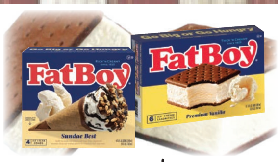
FAT BOY ICE CREAM SANDWICHES 4-9 Ct. Selected Varieties or Freeze Pops or Sundae Cones